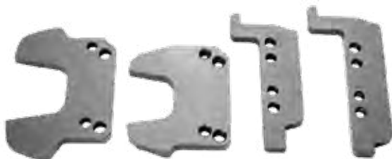
Suitable adapter for every rail profile